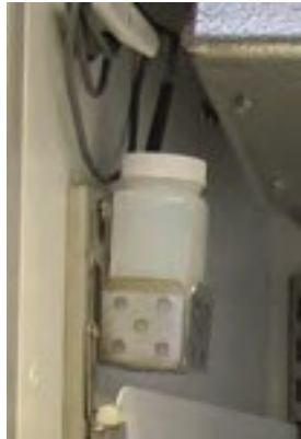
Undercounter probe bottle