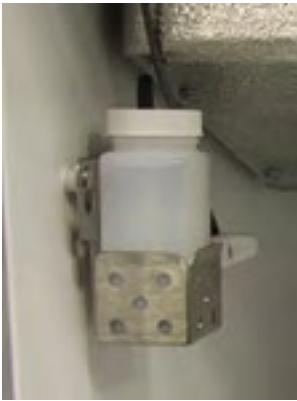
Upright probe bottle

The primary monitor probe bottle is located at the top left side of the freezer.