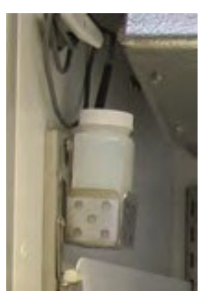
Undercounter probe bottle